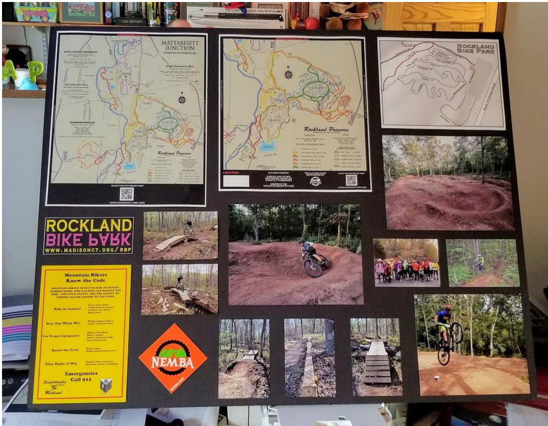
I had trail maps (including Rockland), a warmed-over version of that one-pager did for the pre-The Great Give thing at Bad Sons last year (with an excerpt from the NEMBA.org calendar on the back), and some other odds and ends. Table looked like: